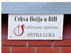
The sign says, "Church of God in Bosnia and Herzegovina, church municipality Ostra Luka".

First of all, I would like to thank you for the powerful prayers you submit to the Lord in favor of His work among us, and also to the benefit of us who are co-workers in His Kingdom.